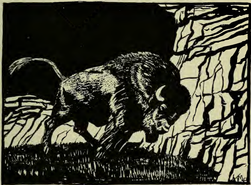
THE BULL RUSHED AT THE MOUNTAIN WITH ALL HIS FORCE